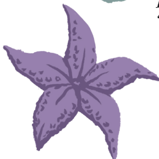
Stella di mare 'Starfish'